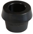
DOUBLE SIDED MAZDA COLLET (PN 85611072)