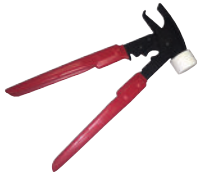
WHEEL WEIGHT HAMMER (PN 85607780)