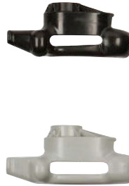
NYLON DUCKHEAD® MOUNT/DEMOUNT TOOL (PN 8183061)

Designed for added rim protection and replaces the steel Duckhead® mount/demount tool and fits RC-45, RC-55, X-Series®, and GTS Series models.