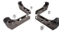
GRIP MAX® PLUS 28" CLAMPS (PN 85607986)

Offers twice the slip resistance than the traditional clamps and built in rim protectors eliminate metal on metal contact.