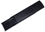
LIFT TOOL SOCK (PN 85000783)