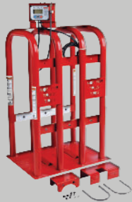
EL-X EXPRESS LANE® INFLATION SYSTEM (PN 85607770)

Eliminates the inflation process wait time on the tire changer resulting in faster bay turns and reduced customer wait times.