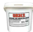
PASTE LUBE BUCKET (PN 8183710)