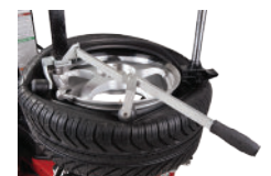
MANUAL BEAD DEPRESSOR & DUCKHEAD® ROLLER (PN 85609077)

Provide a standard external clamping range of 16" up to 28", allowing the convenience of working on a multitude of tire assemblies.