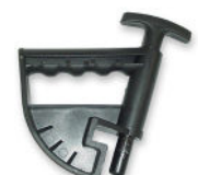
MANUAL DROP CENTER TOOL (PN 8435685)