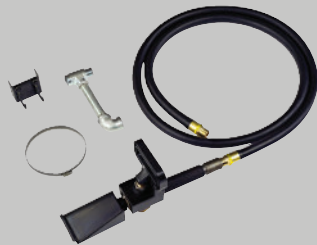
AUXILIARY BEAD SYSTEM (ABS) (PN 85606545)

The Coats® Point of Use Lift System helps you elevate heavy tire and wheel assemblies up to tabletop height with minimal effort.