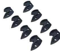
GRIP-MAX® PLUS REPLACEMENT GRIP SET - 8 PACK (PN 8560716108)