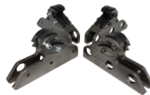
GRIP MAX® PLUS CLAMPS (PN 85607787)

Offers twice the slip resistance than the traditional clamps and built in rim protectors eliminate metal on metal contact.