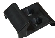
STEEL CLAMP INSERTS (10) (PN 8183604)

Combo design insures the bead stays in the drop center and tire bead does not roll back over the Duckhead® mount/demount tool.